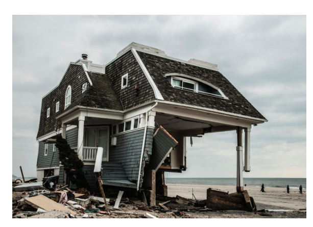
NJ Hurricane Survival Guide